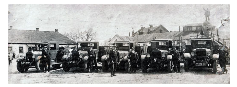
The first car fleet of the sugar refinery plant, 1935*

In the year of 1941 the Koryukivka city had strong economy based on sugar production. Besides sugar factory there were an oil factory, a brick factory, wood harvesting enterprises, agricultural enterprises, schools and kindergartens, hospital.