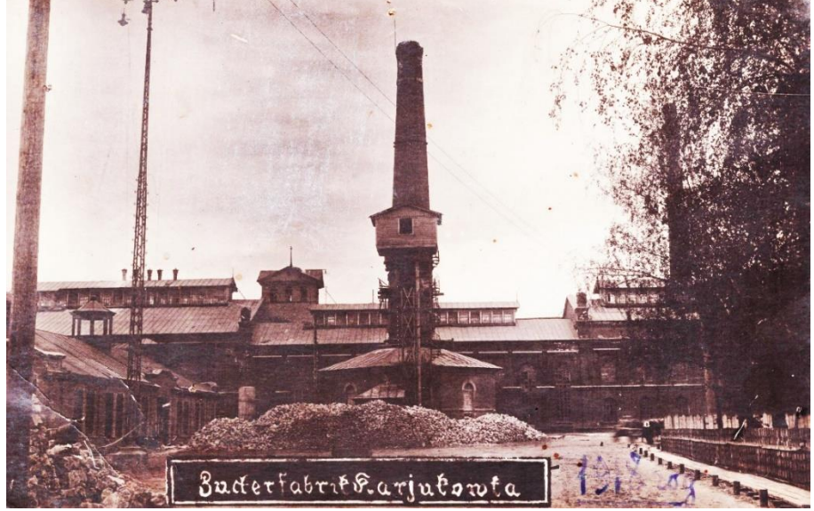
The sugar refinery plant, 1918*

In the year of 1876 a sugar refinery plant was built next to the sugar 1876 factory. The amount of workers was increased to 600 employees.